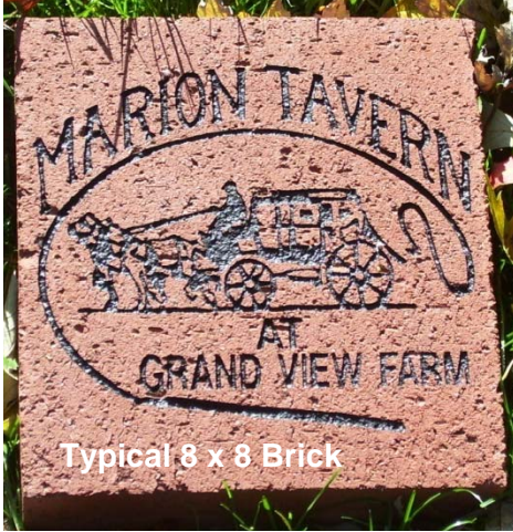
Typical 8 x 8 Brick

The Marion Tavern at Grand View Farm is part of the historical & cultural heart of Burlington. The Town is committed to restoring the property for the benefit and enjoyment of our citizens and future generations. Become a part of Burlington's History by purchasing a brick to be placed on the Grand View grounds and viewed by all for years to come.