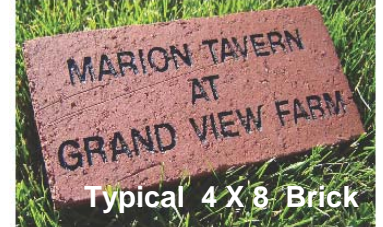
Typical 4 X 8 Brick

Phase I stabilized the structure. Phase II will finish the interior with help from the Students of the Shawsheen Valley Technical High School. They are underway installing heating, plumbing, mechanical and electrical systems, insulation, sheetrock, and other interior elements. Phase III is underway to recreate the Barn by the Fall of 2011. The barn will be an exterior replica and a large modern community room interior. The barn will be available for the residents, business community, civic organizations, and Town Departments of Burlington to use once completed. Phase IV will complete the landscaping, site work, drainage, parking etc in 2012.